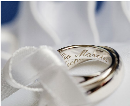
Personalising and engraving jewellery