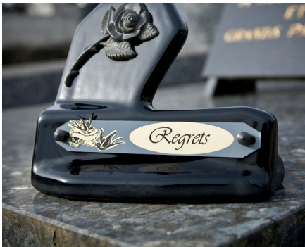
Funeral plaques and headstones engraving