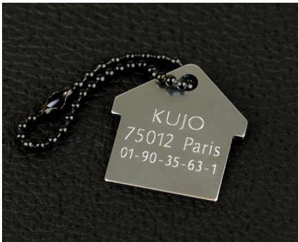
Pet and dog tags engraving