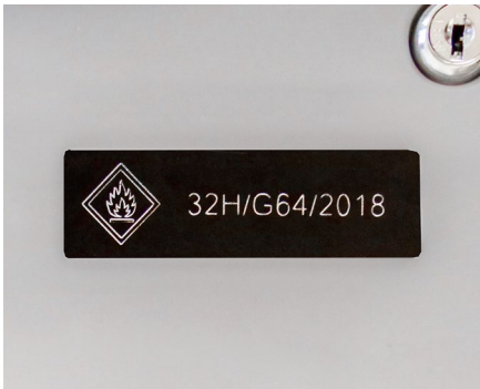
Marking tools for identification and equipment traceability