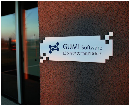
POP displays and sign engraving