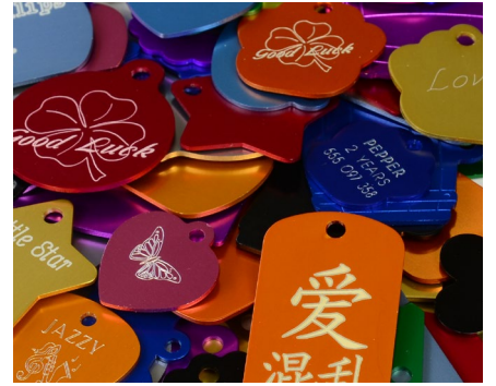
Pet and dog tags engraving