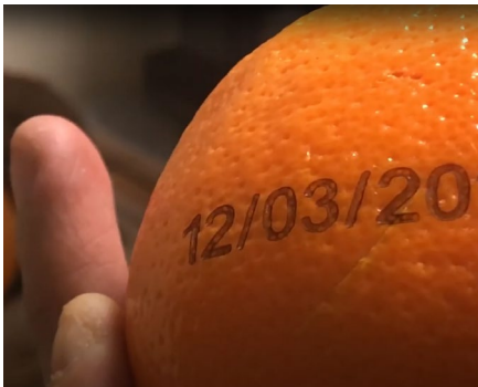
Fruits & vegetables marking