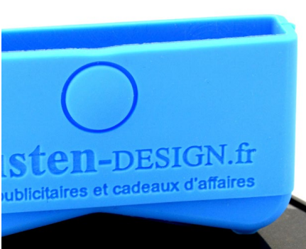
Non-contrasted marking on plastics