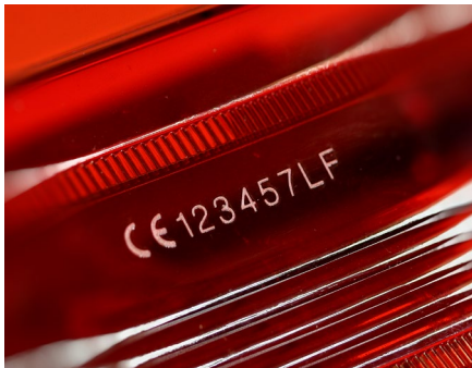
Glass & transparent plastics