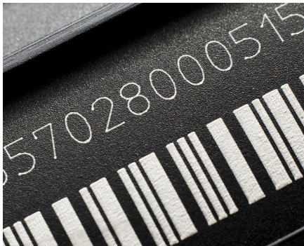
Marking on labels