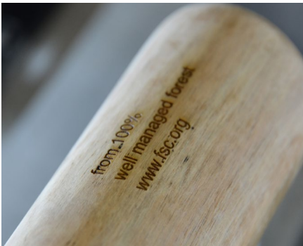
Marking on wood