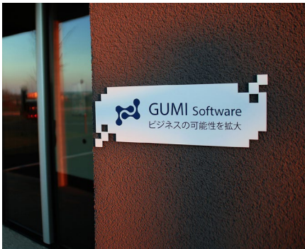
POP displays and sign engraving