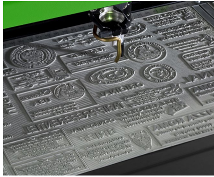
Engraving & laser cutting of custom ink stamps