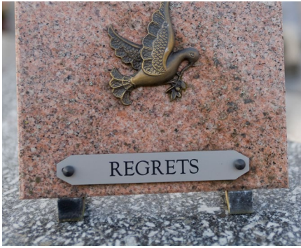
Funeral plaques and headstones engraving