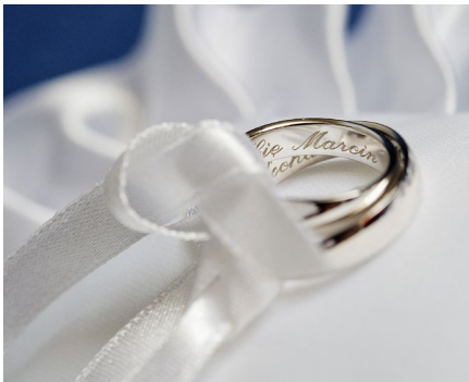
Personalising and engraving jewellery