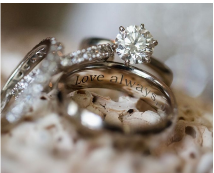
Personalising and engraving jewellery