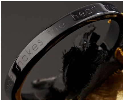
Personalising and engraving jewellery