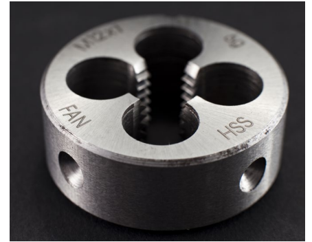
Marking tools for identification and equipment traceability