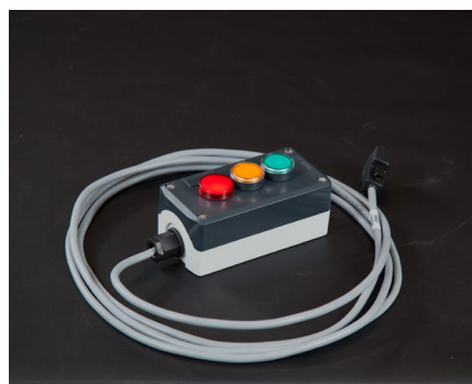
Process Control Box