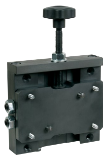
Head Adjustment Device