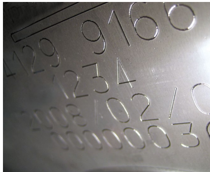
Stainless steel marking