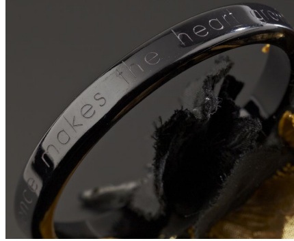
Personalising and engraving jewellery